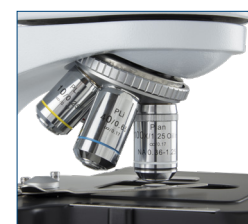
● S100x oil objective with built-in iris diaphragm