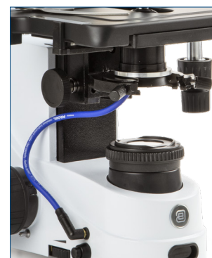
● Cardioid darkfield condenser with 5 W LED and integrated power supply

The unique iCare Sensor is developed to avoid unnecessary loss of energy. The illumination of the microscope automatically switches off approx. 15 minutes after microscopists step away from their position