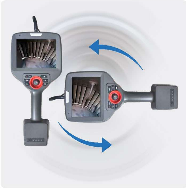
Image File Processing Function

Equipped with G-sensor, the picture can be automatically flipped through the C gesture, so that the image is always at the best viewing angle of the inspector.